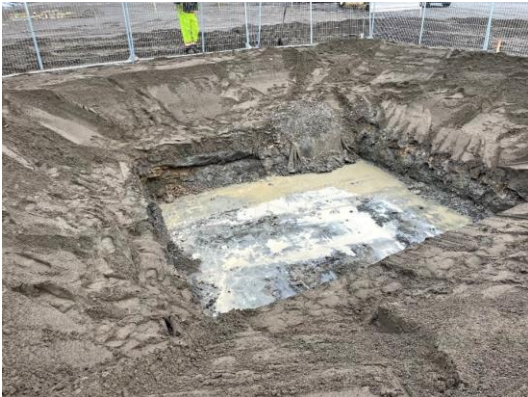
1/11/22 Parcel 2 Clubhouse elevator excavation prior to placement of structural backfill.