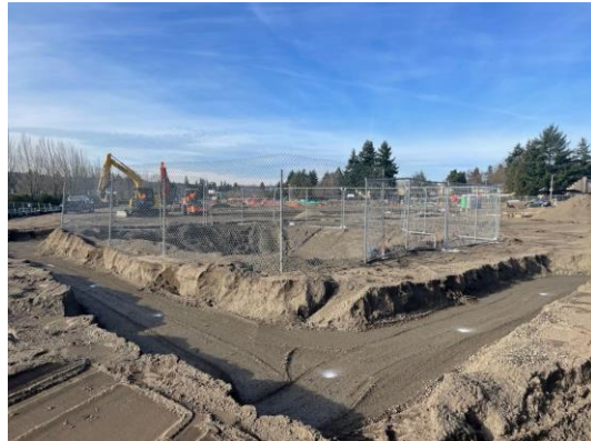
1/12/22 Parcel 2 Clubhouse footing excavations in clean fill, looking northwest. Clubhouse elevator excavation is fenced.