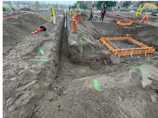
1/5/22 Parcel 1 Building 1 utility excavation and footing forms, looking west.