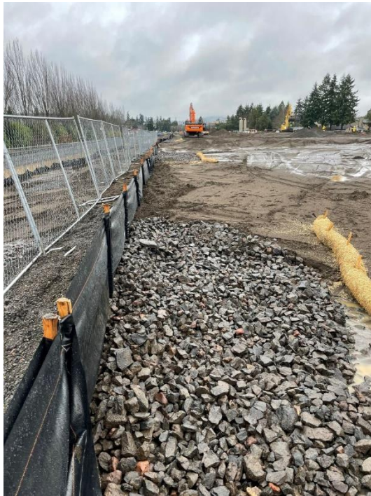
1/3/22 Erosion control measures along south side of Parcel 2, looking west.