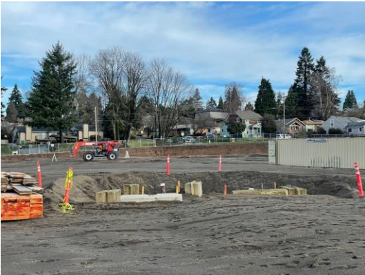
12/21/21 Parcel 2 monitoring wells, looking northeast from Parcel 2.