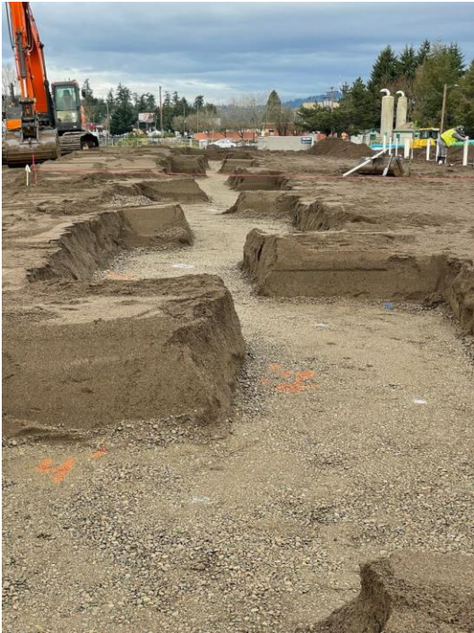
12/22/21 Parcel 1 Building 1 footing excavations with compacted structural fill, looking northwest.