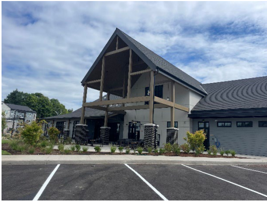
8/9/23 Parcel 2 Clubhouse building, asphalt pavement, concrete pavement, and landscape cap.