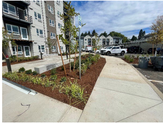
8/9/23 Parcel 2 landscape and concrete pavement cap with Parcel 1 Building 1 in background.