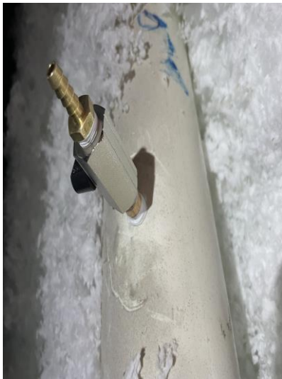
5/4/23 Clubhouse radon effluent stack sampling port installed ahead of vapor intrusion assessment sampling in July 2023.