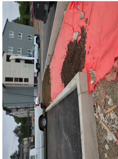
5/22/23 Clean import landscape soil placed over permeable marker fabric within Parcel 2 curbs.