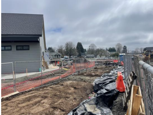
3/29/23 Parcel 2 utility and tree well excavated soil placed in parking stall footprint south of Clubhouse, outside clean backfilled utility trenches. Area is enclosed in fencing, covered in plastic sheeting, and pending compaction and subgrade preparation for final cap.