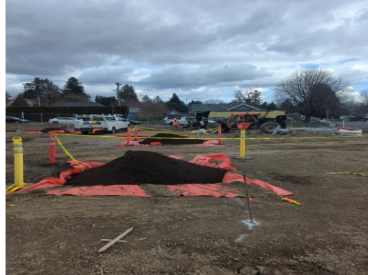
3/15/23 Parcel 2 tree wells excavated and backfilled with clean import landscape soil over orange landscape marker fabric.