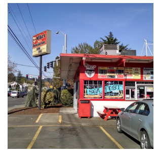
icon: mike's drive thru