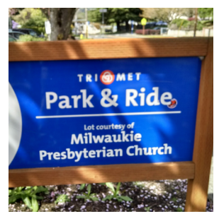
existing signage : trimet - park & ride