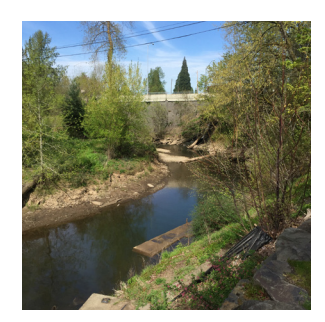
natural area: johnson creek