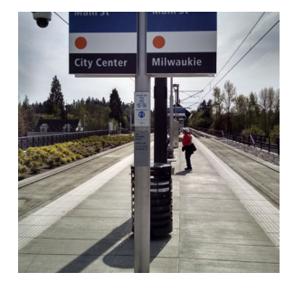
public transportation : orange mall