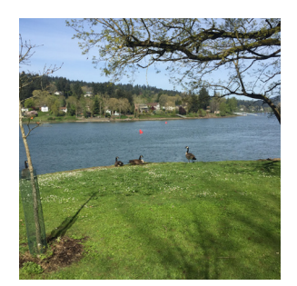
natural area: kellogg creek park