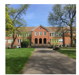
school: portland waldorf