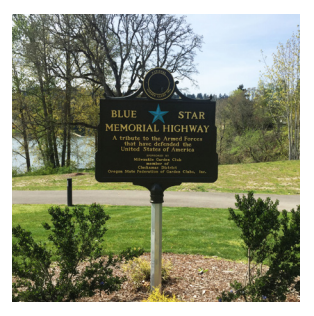
existing signage: blue star memorial hwy