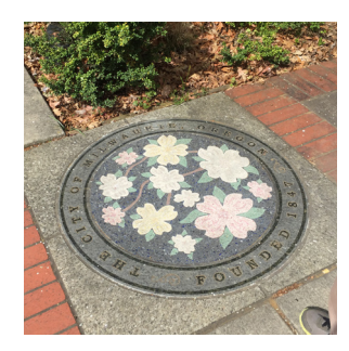
icon: sidewalk inlay