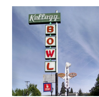
icon : kellogg bowl