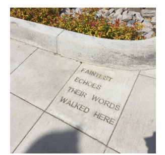
art: sidewalk poetry