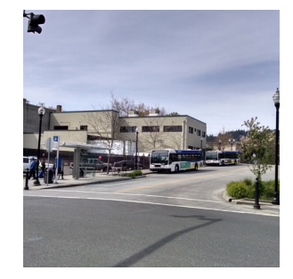
public transportation : bus transit mall