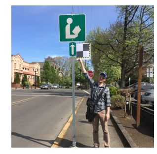
existing signage: library directional