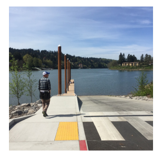
natural area: riverfront boat ramp