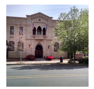
historic: masonic lodge