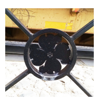
art: fence detail