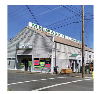
icon: milwaukie lumber co.