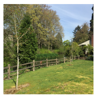
natural areas : scott park