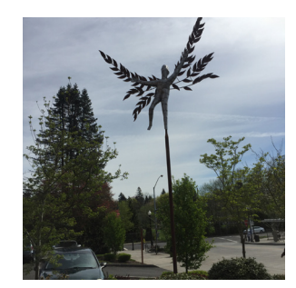
art: city hall sculpture garden