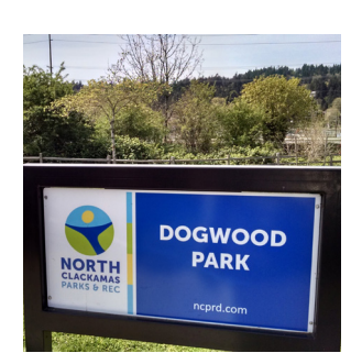
existing signage: ncprd sign - dogwood park