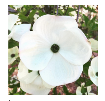
icon: dogwood flower