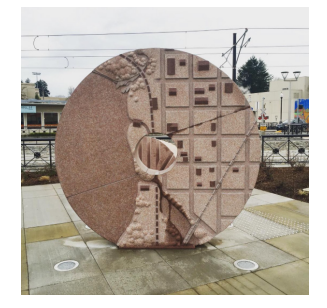
art: MAX station sculpture