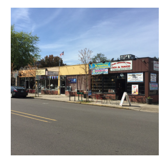
businesses: main street store fronts