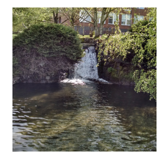
natural area: spring creek