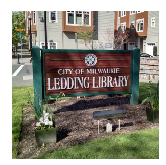
icon: ledding library