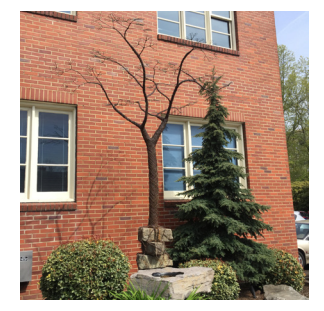
art: city hall sculpture garden