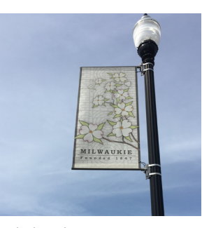
existing signage: street lamp banner