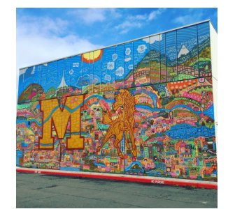
art: m.h.s. mural