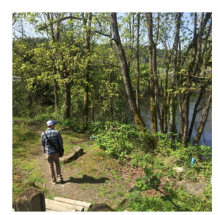
natural areas : dogwood park