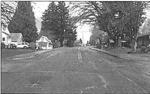
SITE PHOTO 1: North crossing (NB)