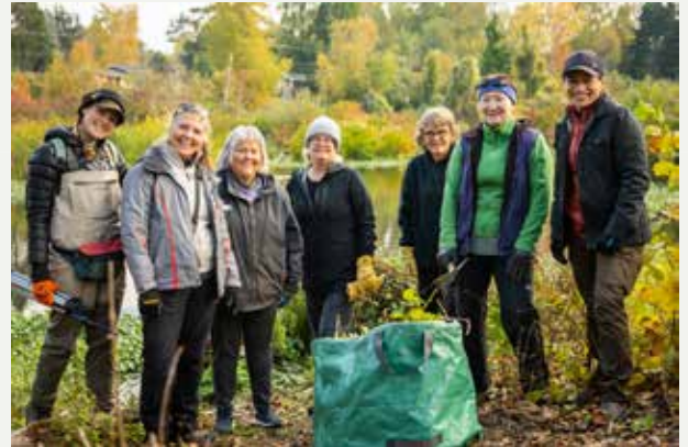
Minthorn Springs clean-up volunteers

Kellogg Dam gone by 2027? That's the latest, very exciting prediction! There's a LOT to be done by then, but a huge interagency group is hard at work. You can follow their monthly updates and other news at www.milwaukieoregon.gov/kellogg