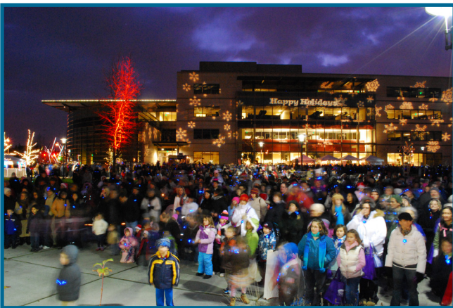
Redmond Lights festival

enhance awareness of diversity, cultural traditions, and Redmond's heritage throughout the community. By providing community events, such as Derby Days and Redmond Lights, as well as a wide variety of other public activities, the City serves as a conduit, supporting these interactions and possible community building outcomes that can support a myriad of other objectives from disaster preparedness to economic vitality.