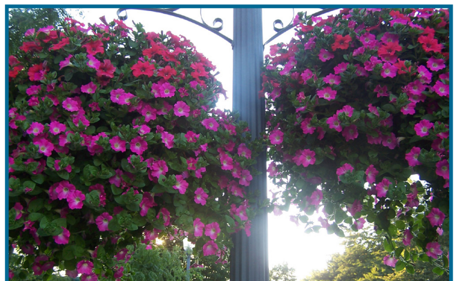
Hanging baskets brighten the downtown streets in summer