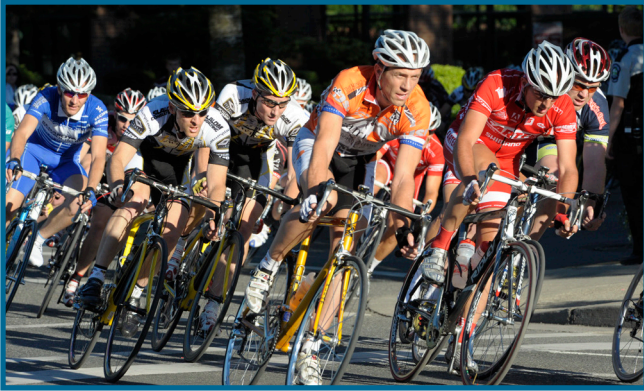
Derby Days Criterium