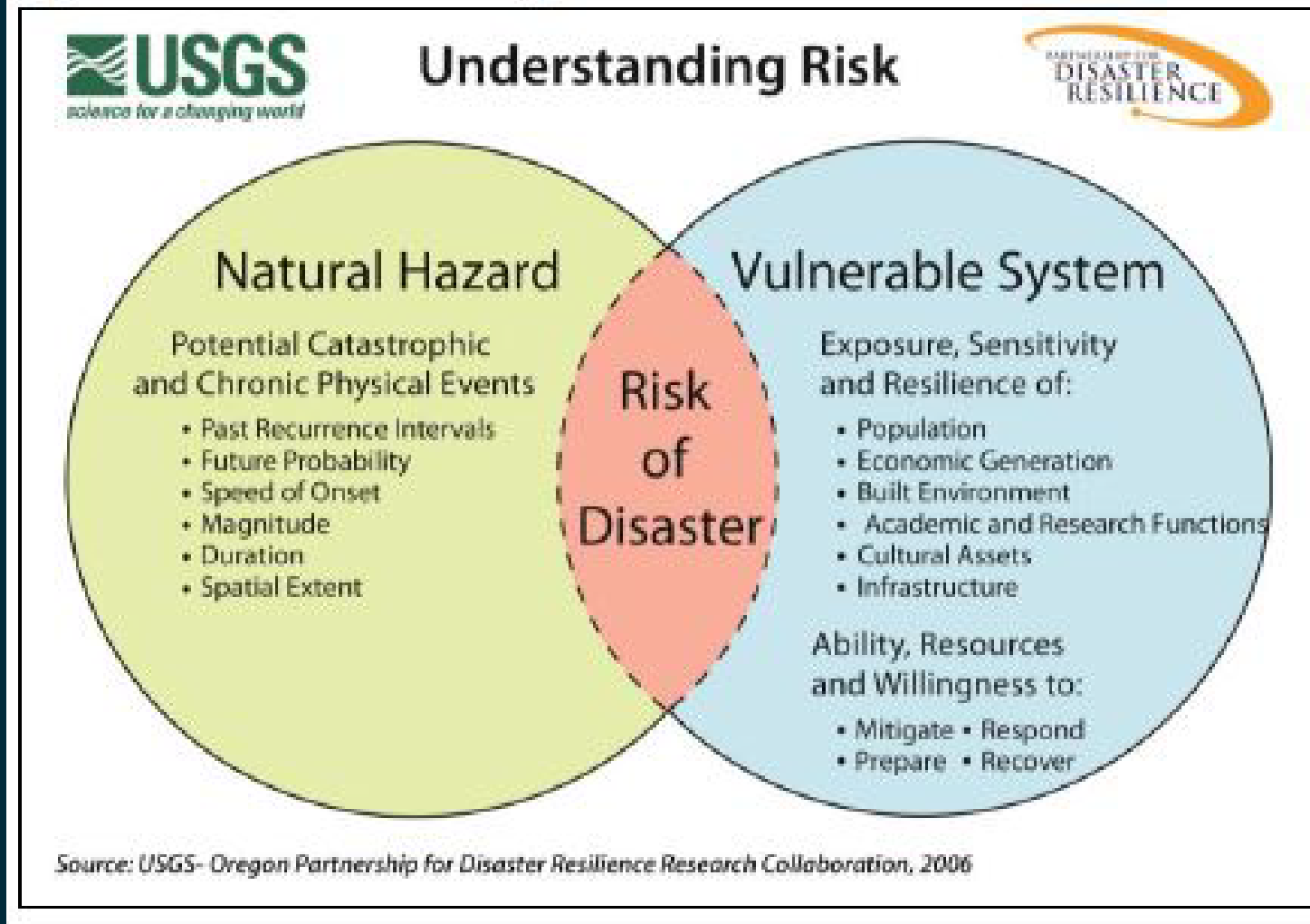
Figure MA-1 Understanding Risk