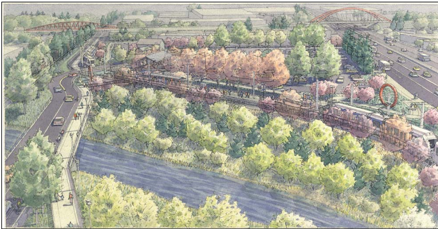
Tacoma Station Area Rendering

The Portland to Milwaukie Light Rail line is expected to open for service in 2015 and will include a station near the SE McLoughlin Blvd/Tacoma Street interchange. The Tacoma Station Area Plan (Plan) is being developed by the City of Milwaukie in coordination with others to examine