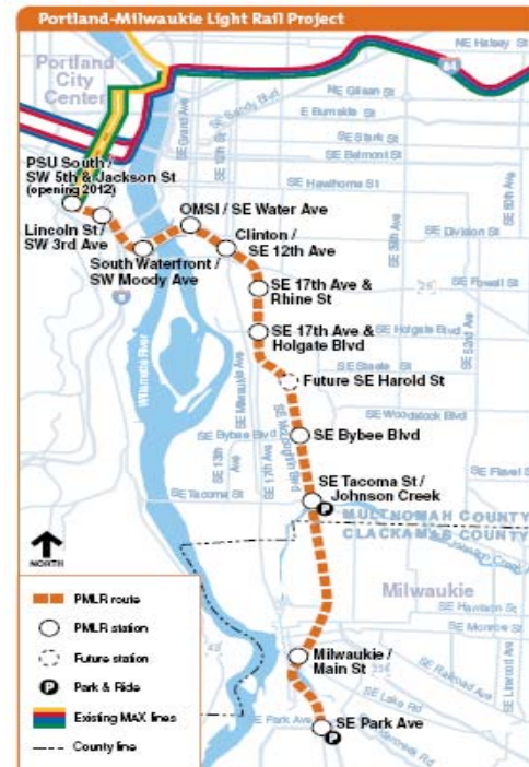
Portland to Milwaukie Alignment